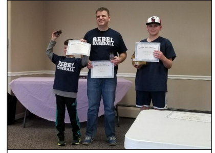
The Greatest of These