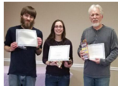
Beauty & The Beards