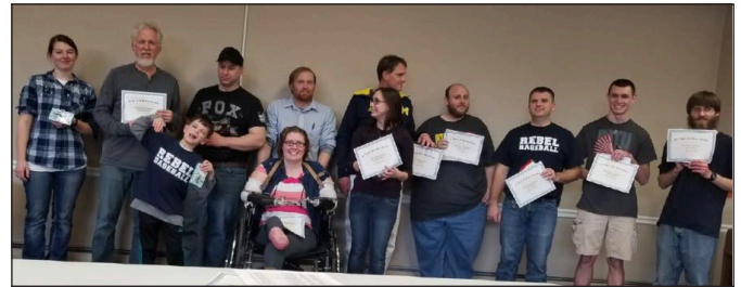
All Timers Tournament top 12 All Stars